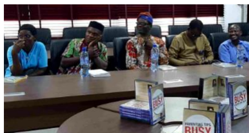
A cross section of presenters of Ijiroro lati inu bibeli .