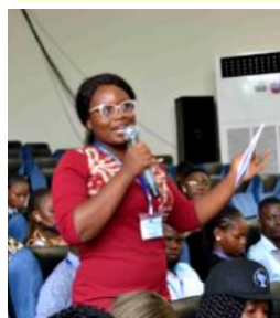
A participant poses a question.