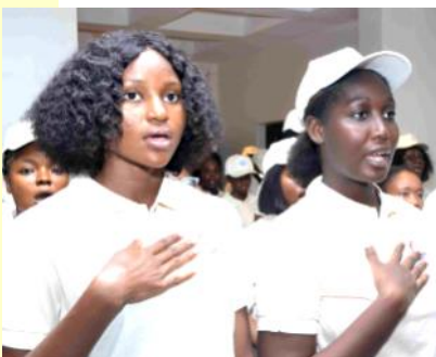
Inductees take their oath.