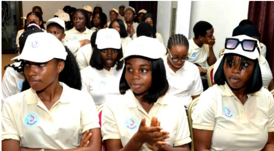
Ready to soar: A cross section of the inductees.