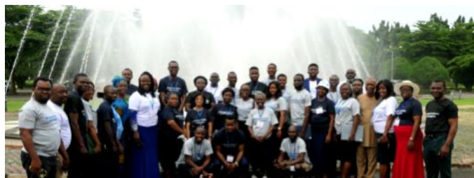
A cross section of some facilitators and participants.