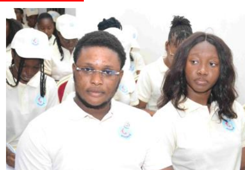
Proud to belong: Some of the inductees after the oath taking.