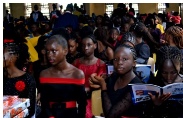
Graduating students from JSS 3

"Funding of education has to be deliberate to ensure every individual has education," he said.