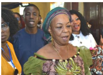
Some of the graduating students' parents at the ceremony.

“You are now a graduate because you endured and did not quit. You came, saw and conquered,” he said. “There is another better phase for you. Never lose sight of God.”