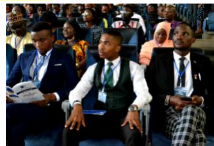
A cross section of the participants