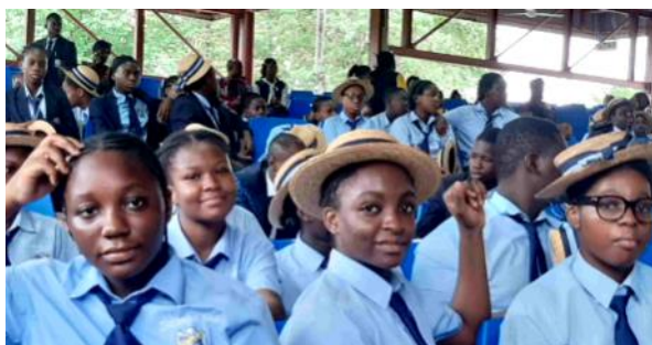
Graduating students from JSS 3. Pictured right: A senior graduating student.