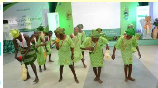
A dance drama presentation by one of the secondary schools in Sagamu..