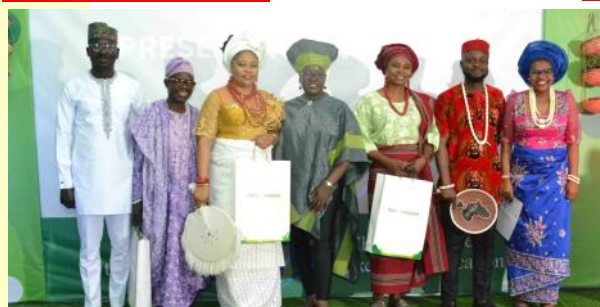
Leaders of TeachNigeria display their awards at the ceremony.