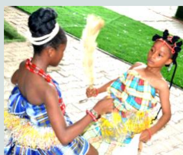
Clockwise: Chore-graphic dance by pupils, teachers at the event and Effik dance presentation by the pupils.