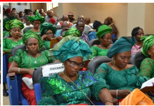
Proud sisters of the inaugural lecturer