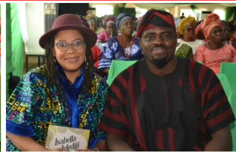
The Comperes at the event.