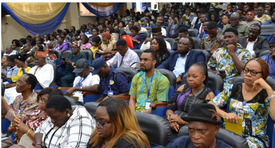
A cross section of the audience listening to the inaugural lecturer.