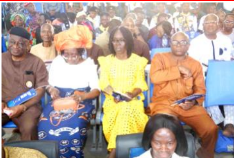
BU community members and guests