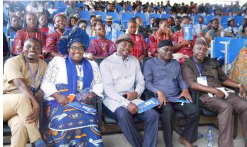
A cross section of BU faculty and BUHS Cultural troupe.