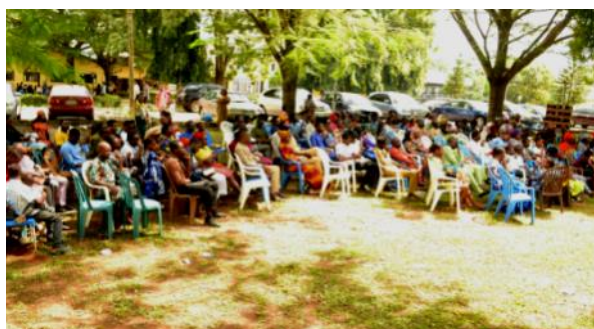
Heritage Church members enjoy outdoor worship