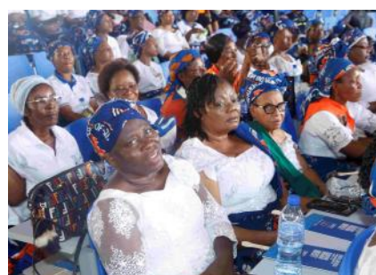
Women for Christ: Adventist Women Ministries