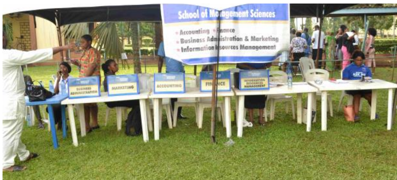
Waiting for the registration to start. Right: School officers assist as students get their documents checked.