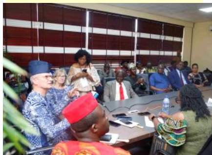
Interaction with the media.

Among his entourage were leaders from the General Conference of Seventh-day Adventists in Maryland, USA as well as the West Central African Regional headquarters in Cote d'Ivoire.