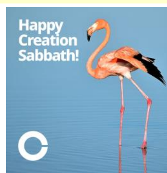
Celebrating the beauty and diversity of God's creation