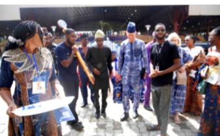
BUSA officials lead the way for the academic building commissioning.