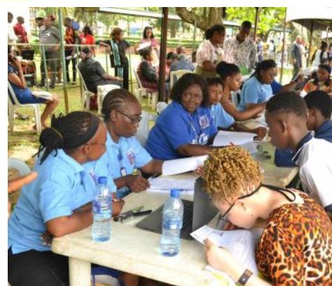
Registration in progress at the ceremonial grounds