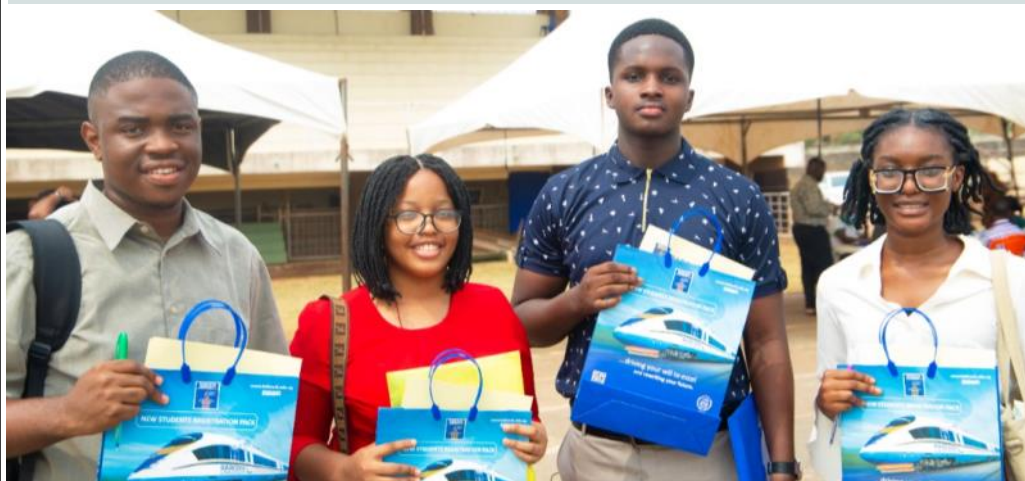
Starting strong: Fresh students commence registration as they get ready for a new start.