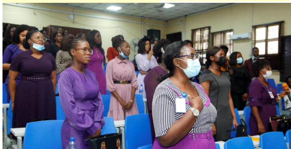
Old and new inductees of the Alpha Beta Gamma chapter take the Nursing anthem.