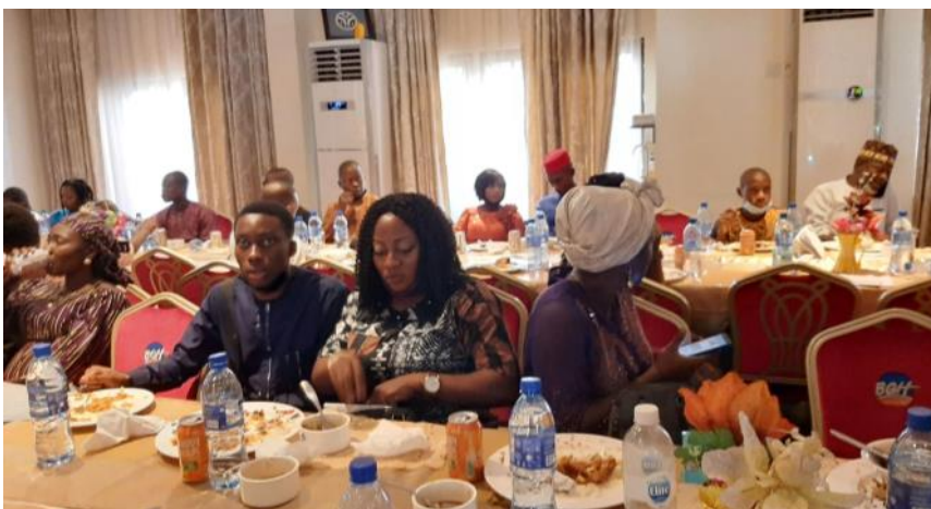
A cross section of journalists and their family members at the luncheon

Hospitality and Service: BGH staff (right)