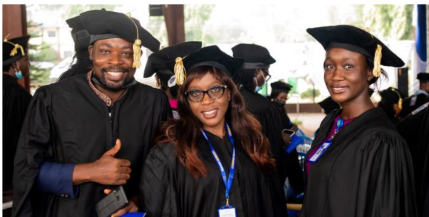
Some of the matriculants share the joy of the moment

He also urged the students to work hard to access the research grants made available by the University administration for postgraduates.