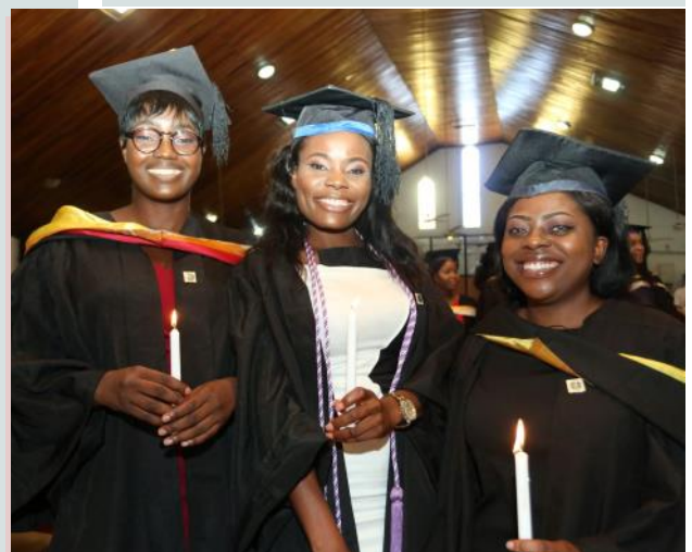
Some of the graduates at the event.