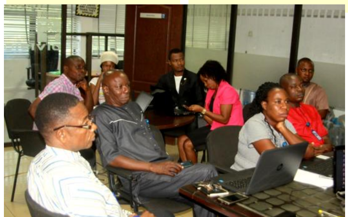
A cross section of participants at the training.

“Memos are expected to be concise and clear,” he said. “Do not be ashamed to check up your grammar for errors before dispatch to the intended recipient.”