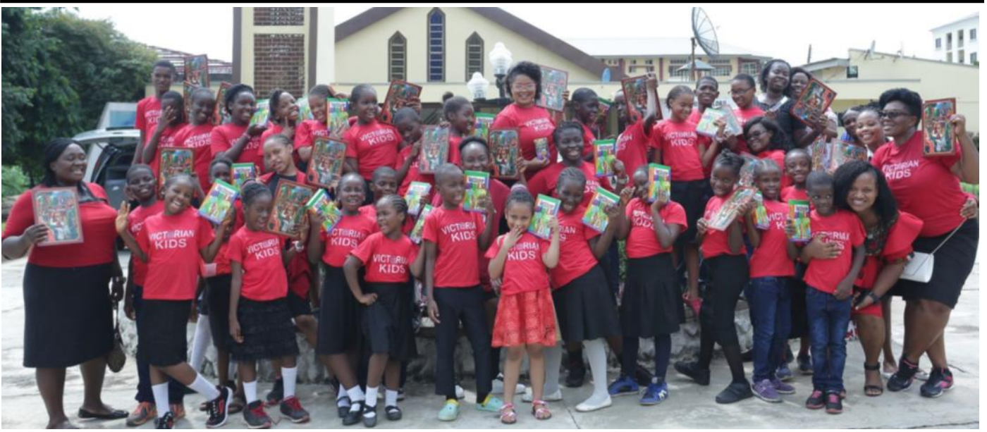
The Victorian Kids' Team members outside the Babcock Pioneer Church before they set out for their evangelistic outreach programme in Ilishan town. Bottom left: One of the kids presents a Bible to one of the beneficiaries.