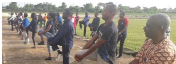
Departments in Presidency division took time out to exercise and keep fit. Pictures show the different faces and exercises.