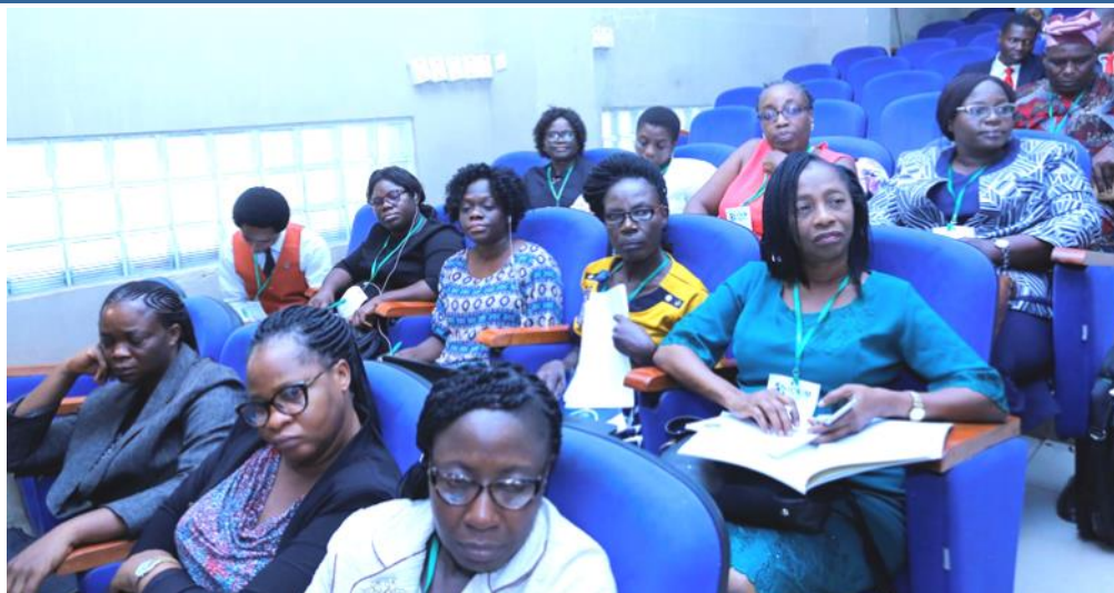
Cross section of participants at the international conference on Knowledge and Innovation Management.

What role does knowledge play in sustainable development? That was the crux of the matter as Babcock University lent its voice to the global call for developing a culture of knowledge sharing for sustainable development.