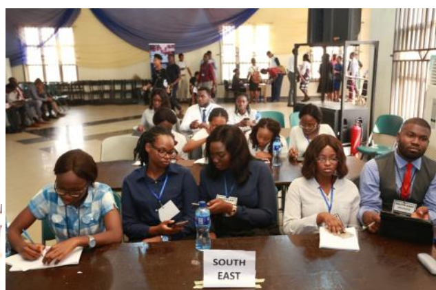
Clockwise: Cross section of participants at the symposium. Delegates from the six geopolitical zones of the country attended the symposium. Pictures delegates from South East and North East geopolitical zones.