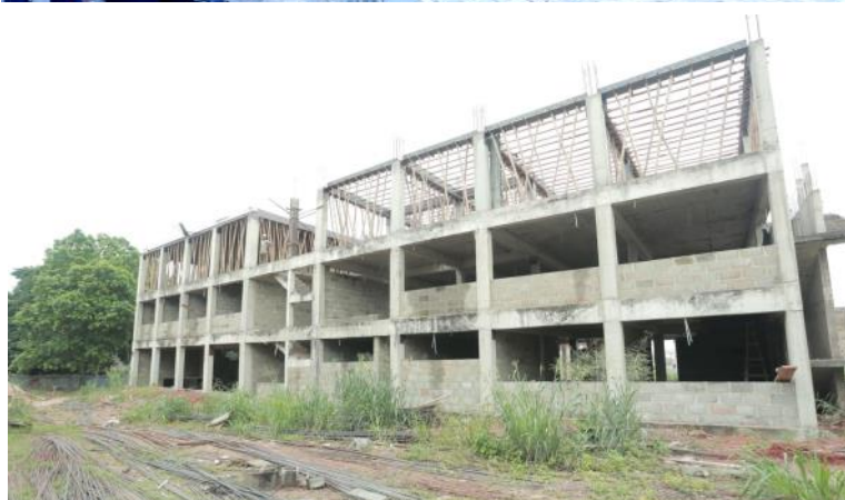
Work in progress: Rear view of the alumni secretariat