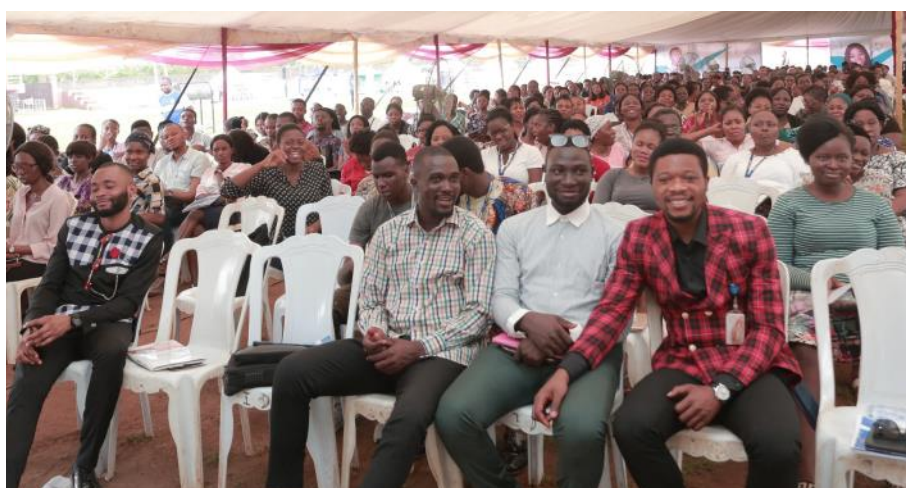
A cross section of the students at the fair.