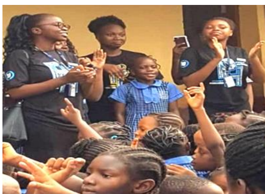
Public Health students promoting hand washing at the BU Staff School.

They wrapped up the week with an award night dinner tagged, A Hollywood Night and thanksgiving held at the Beulah Chapel.