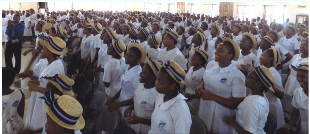
A cross section of the BUHS students at the Efuntade Hall during the week of Prayer.

The Babcock University High school Week of Prayer, February 2 - 8, yielded 25 baptisms and still counting..