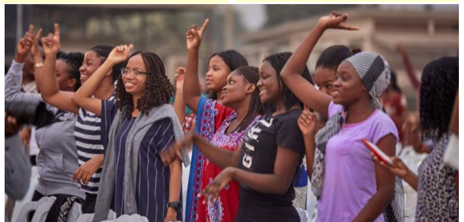
In Iperu campus, students sing and demonstrate the song, God is So Good .