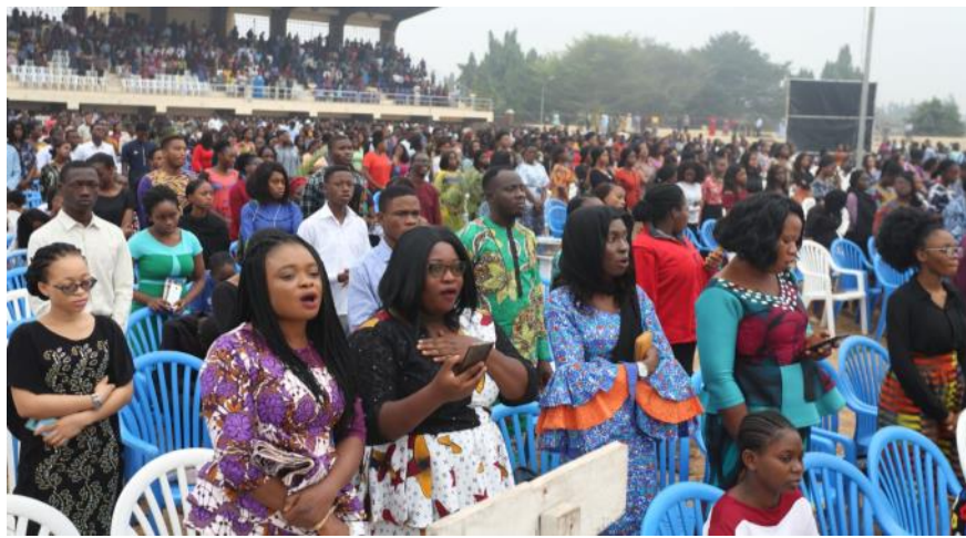
A cross section of the congregation on the main campus sing the theme song. Pictured right is guest preacher, Pastor Moyo.