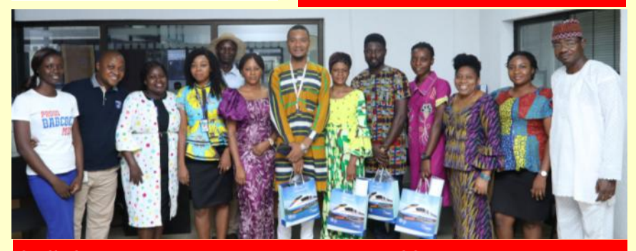
Staff of the department with the interns and NYSC members.