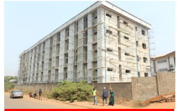
Top: External view of the BUTH compex. Bottom: Front view of the complex.