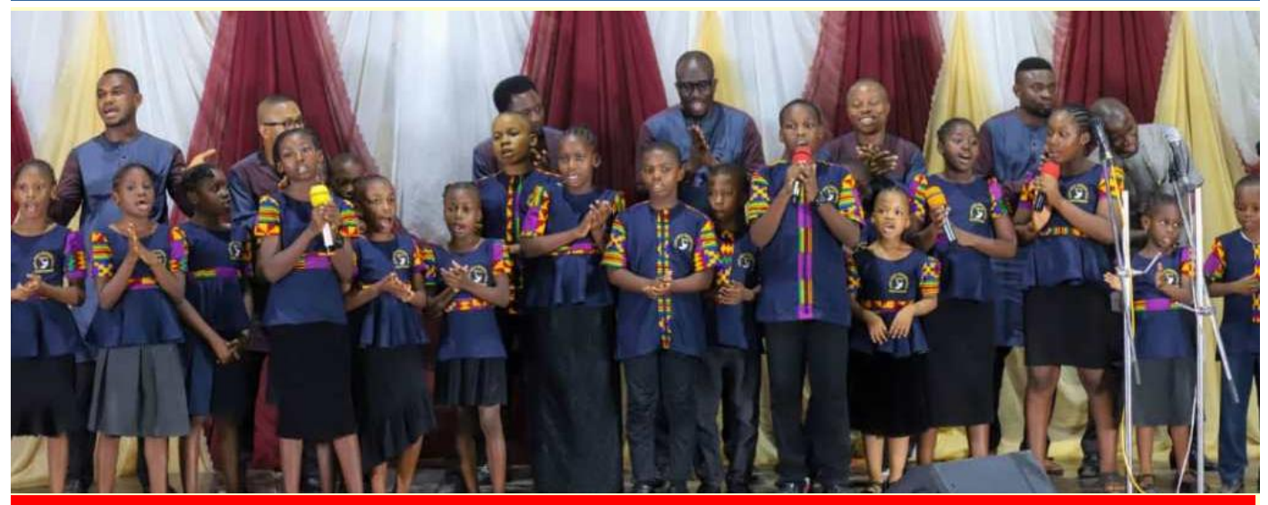
The Chord in a special appearance with the children's choir of the Junior Eagles' Leadership & Mentoring Group make a special appeal at the fund raising concert.