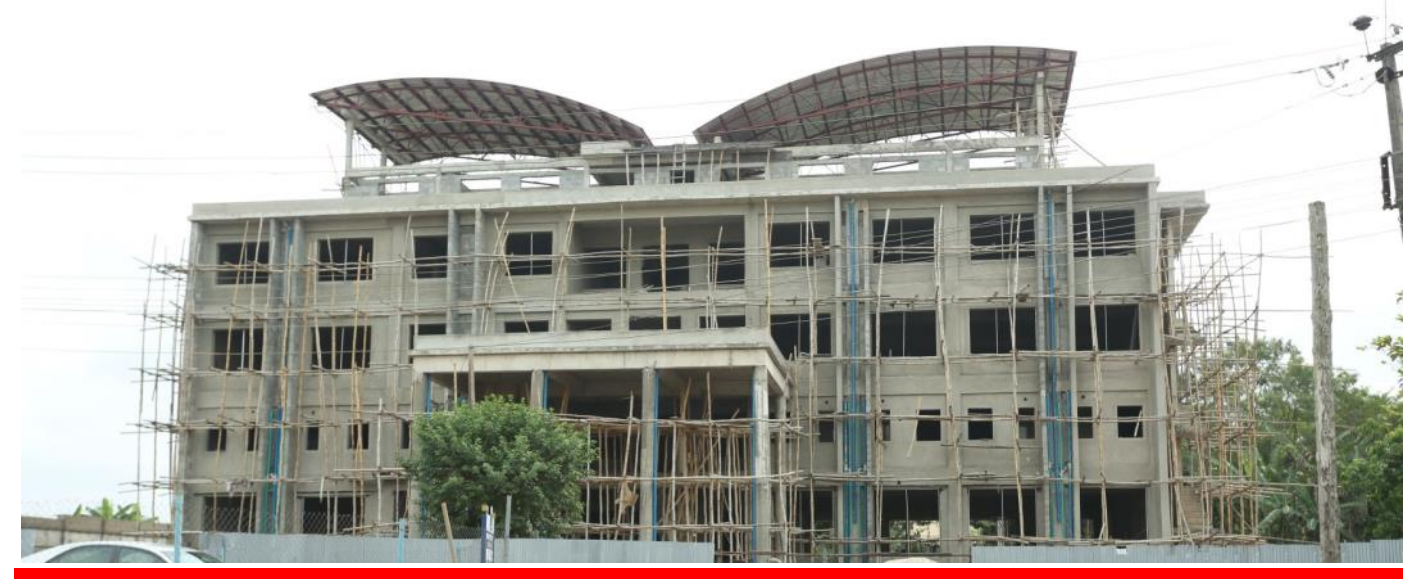
Work in progress: Front view of the Alumni Secretariat with the butterfly roofing. Bottom is the 3-D design showing what the completed project would look like.