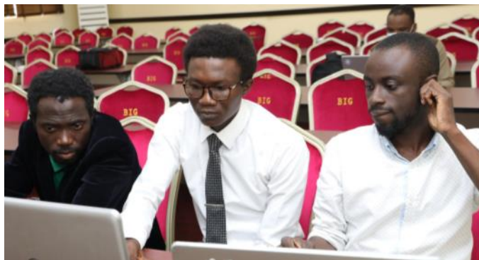
The support ICT team