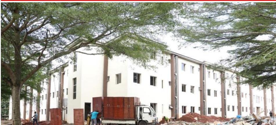
Work in progress: Workmen bringing in the wardrobes for the New Winslow Hall.