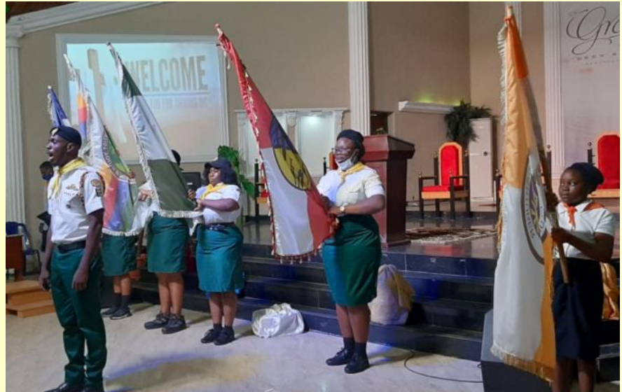
The flagbearers representing the different cadres of the victory Pathfinders Club.