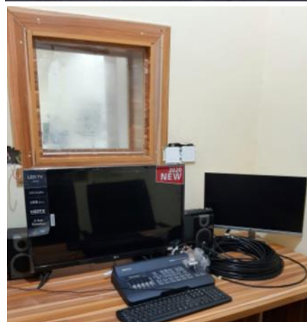
Top and left: Studio for the BU Distance & E-Learning Centre