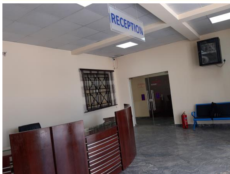
Waiting for Accreditation team: BU Centre for Distance & E-Learning