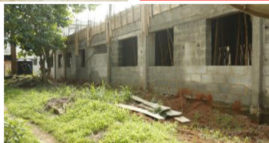
Top and bottom: Work in progress at the New Horizon building site.

He said block work on the first floor of the project situated beside the School of Computer Sciences, is already completed and work is ongoing for the second.