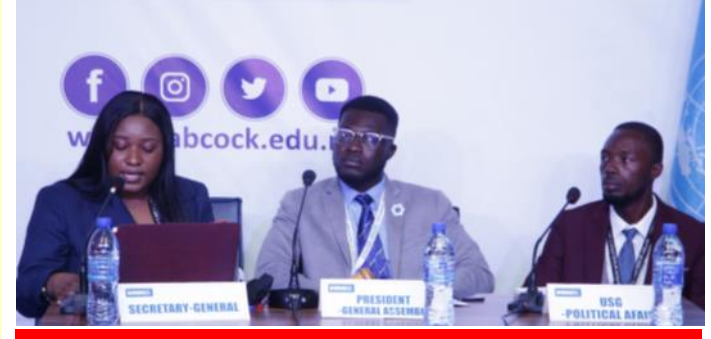
Starting strong: Youth representatives of the 5th BIMUN General Assembly preside over the opening session

year's conference, Mobilizing Multilateral Efforts for Poverty Eradication, Quality Education, Climate Action & Inclusion, as