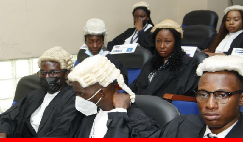
Representatives of the International Court of Justice at the Hague

In the same vein, Senior Special Adviser to