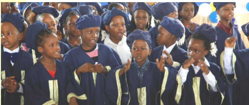
Song presentation by the graduating kindergarten pupils