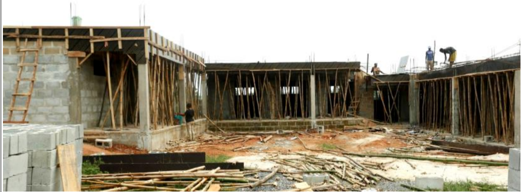
Front view of the new 48-shop retail outlet still under construction.