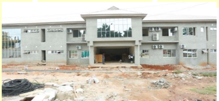
The front view of the MRI wing of the new A & E of the BUTH

The shops will not only serve the needs of the University community but also other members of the public.