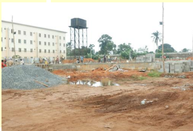
Ongoing construction at the female hostel and below, female Activity hall