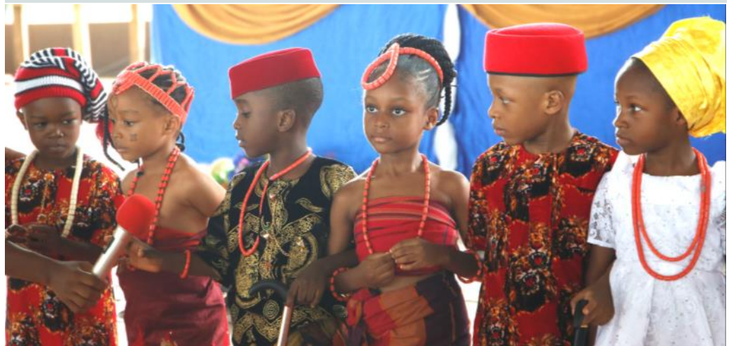
A touch of Culture: Babcock University Staff School kindergarten pupils perform at the annual End of year and Prize giving Day.