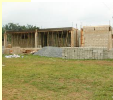
Side view of the lock up shops

“We are looking forward to August 31 for completion of the retail shop project.”