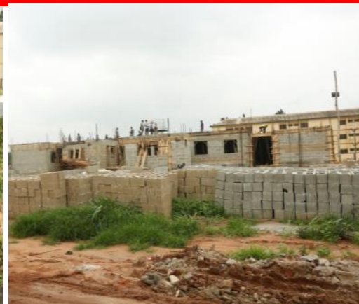
Work in progress: Aerial and side view (right) of the male hostel

A head of student resumption later this year for the 2021-2022 academic session, the University is increasing the stakes of its infrastructural capacity.