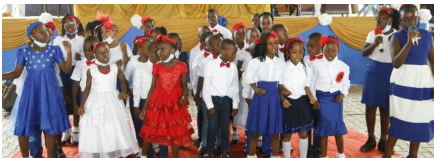
The children step up for the French musical presentation