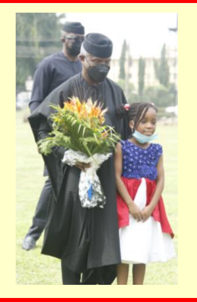
The 33rd inaugural lecture of Babcock University held in the University main campus. Pictures capture the faces and scenes.