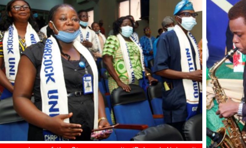
Some members of the Otun community (Babcock University Chapter ) at the event

as a way forward, the Seventh-day Adventist Church leadership can find a solution through proffering a supervisory role. This implies harnessing the leadership of those churches to come under the leadership of the parent SDA church through pastoral conventions where they can express their views.