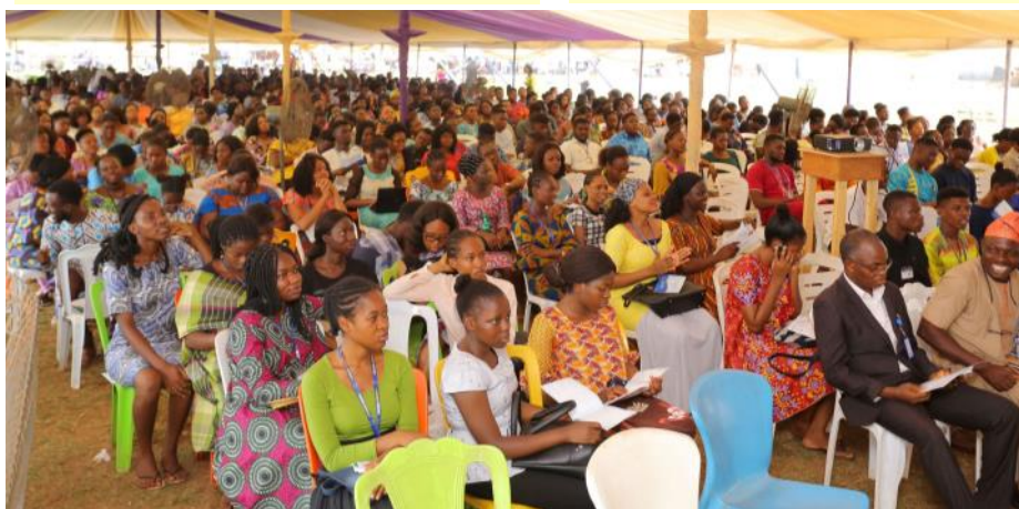
Cross section of previous graduating class members at the Alumni Department-organised Career Fair.

My assignment as Director of Development & Strategy is challenging. But I thank the University administration and look forward to holding my head high like I did while in Alumni.