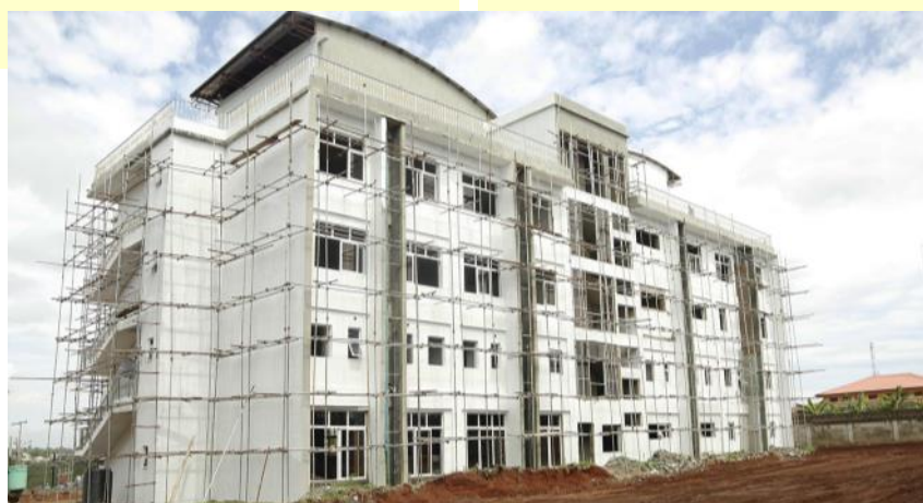
Work in progress: The new Alumni secretariat under construction redefines the concept of a meeting place for the alumni.