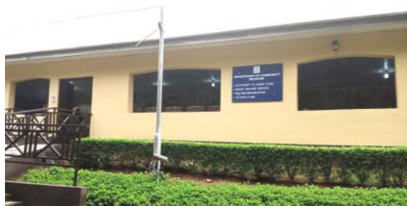
Department of Community Medicine: Venue for the vaccination