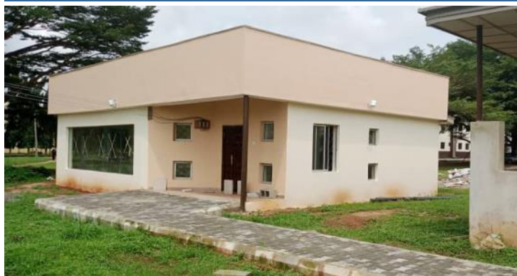
New Laundromart building