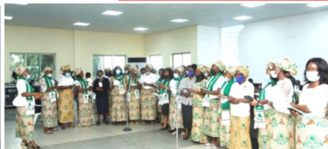
Members of the Shepherdess International, comprising pastoral wives delivers a consolatory message in song.