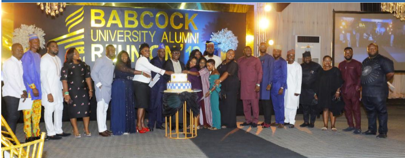
Memory of the 2019 Home Coming: Some Alumni members celebrate homecoming in Lagos, Nigeria.

W ith the new redeployment of officers, former Director of Alumni moves on after 11 years on the job under two administrations. He shares his experiences with the editorial team as he moves to focus on his role as Director of Development & Strategy, one which he once combined with the Alumni Directorate. Excerpts: