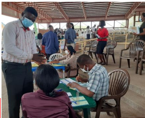
BUTH staff busy with BMI and vitals before the Covid-19 screening for students re-sumption earlier in the year