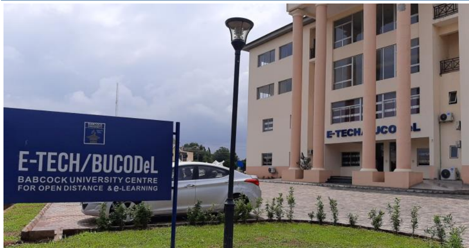
Front view of the BUCODEL building

PowerPoint as well as staff training and retraining.