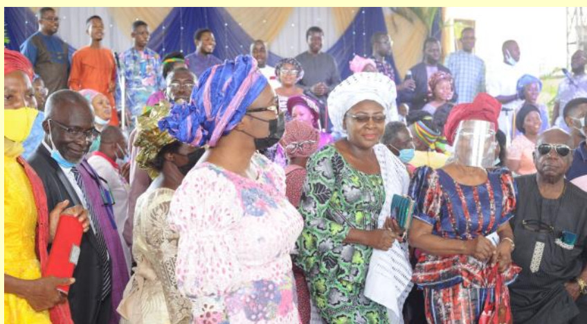
The retirees dance and give glory to God at their thanksgiving during worship.

the retirees for their dedication to duty while in service and commitment to institutional building. He also used the occasion to extend a prerogative of mercy to recall two staff members sent on early retirement.