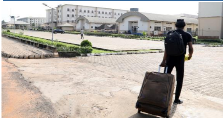
Back to school: A student arrives with his luggage.