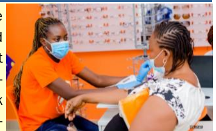
A patient at the Eye Clinic

Meanwhile, the INGO has opened its Grace eye specialist clinic in Magboro, Ogun State to provide affordable and professional clinical intervention to