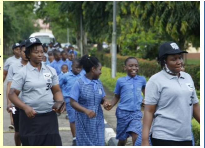
Some teachers leading the pupils during the campus rally.

For now, the celebration has brought not only beautiful memories but a desire to strive to attain greater heights.