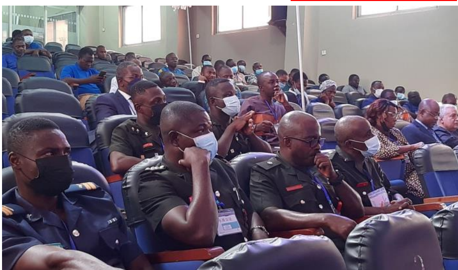
A cross section of participants from different member countries across West & Central Africa