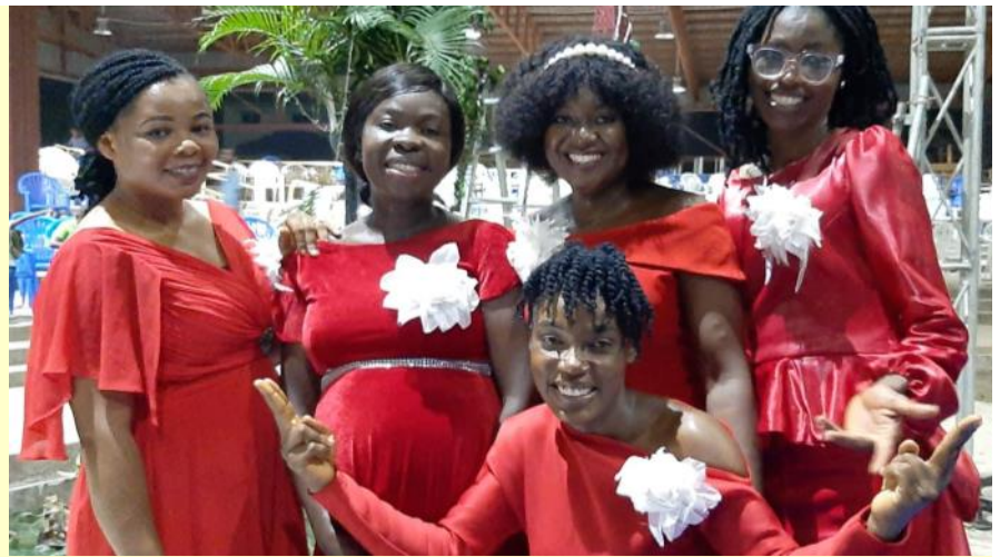
Faces and moments at the Feast of Light.