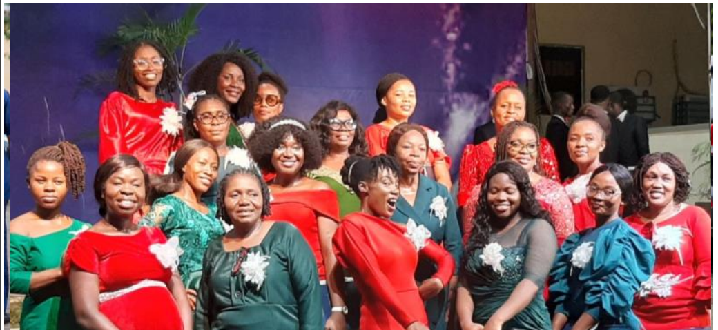
Message in songs: Some of the female choristers of the University choir.