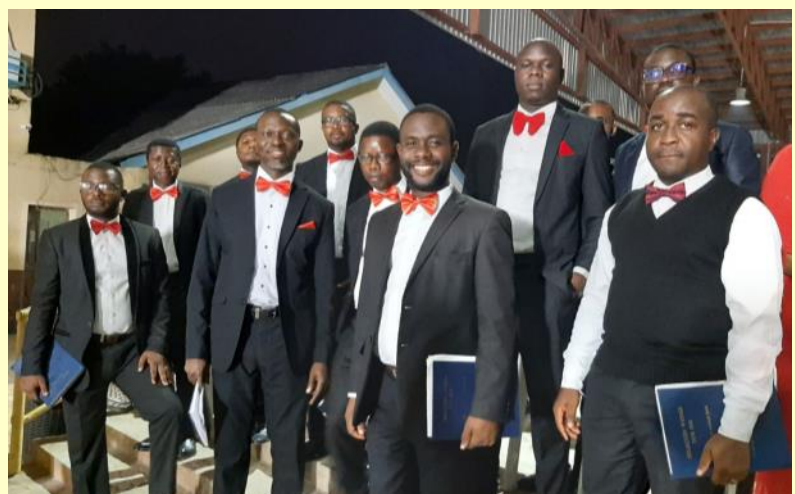
Men's Affair: The male members of the University choir.