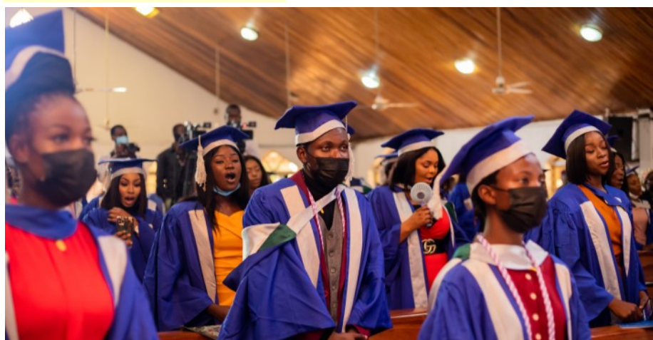
The inductees sing the Nurses' Anthem