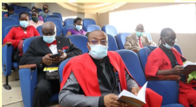
A cross section of faculty and staff at the lecture