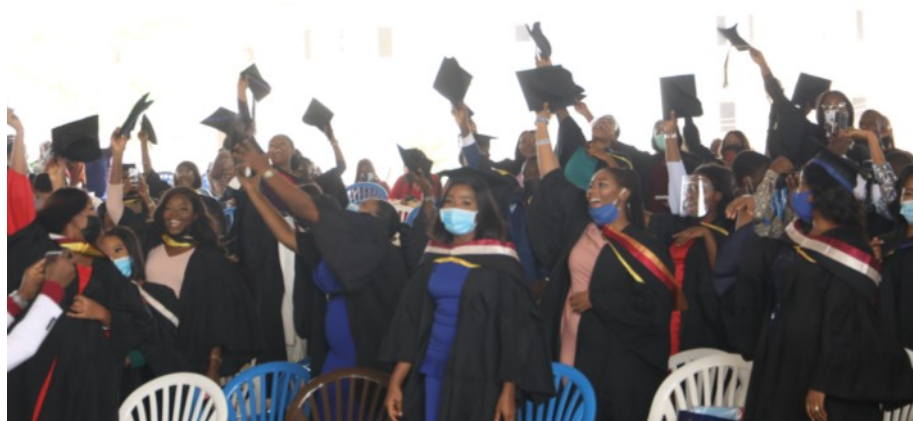
The Joy of Success: The inductees jubilate shortly after taking their oath.