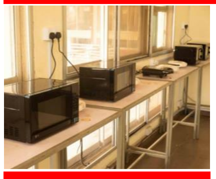
Some of the new microwave ovens