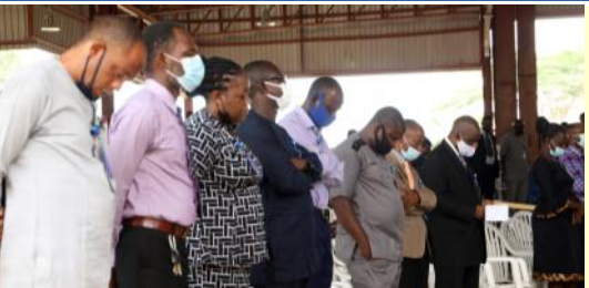
Faculty and staff in a prayer session.

Pollowing rising cases of violence and national insecurity in Nigeria, the University administration last Tuesday declared a special day of fasting and praying.