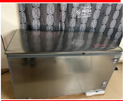
The deep freezer