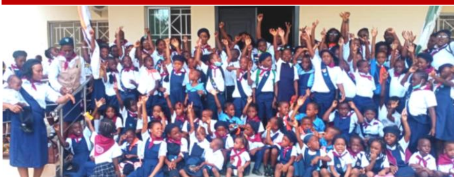
Adventist Youth for Christ: The Adventurers celebrate with their leaders.

M embers of the University Pioneer Church marked the World Adventurers Day, May 14 with the global Seventh-day Advent-ist Church.