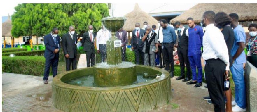
The University officers, BUSA officials and sponsors bow as they offer dedicatory prayers after the unveiling.