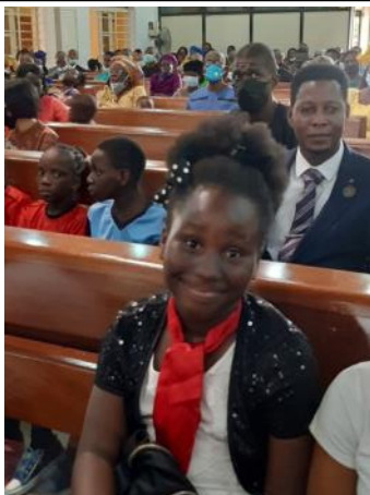
Some of the children at the programme Below: The cutting of the cake.