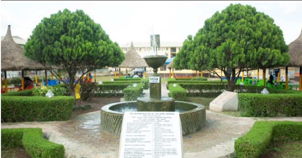
A lasting legacy: The BUSA gazebo gift to Babcock