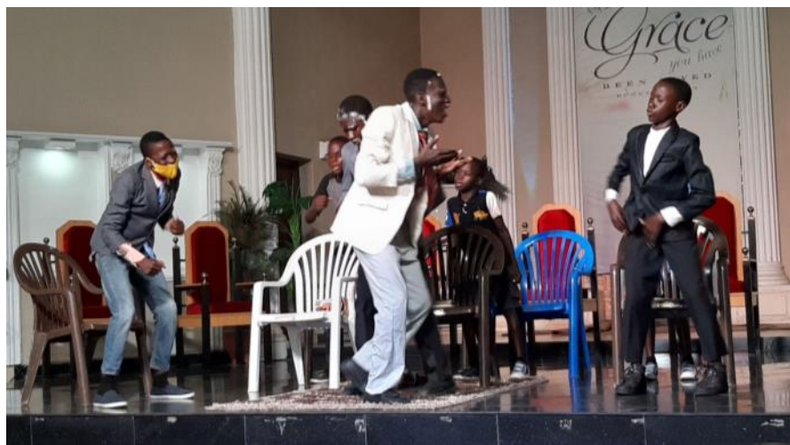
A scene from the drama sketch by the youth from Kings Heritage Orphanage, Ijebu Ode.