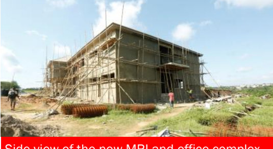
Side view of the new MRI and office complex of of phase 1 of the new A & E

"The brick work and electrical works are on-going and we have also followed the specifications to ensure