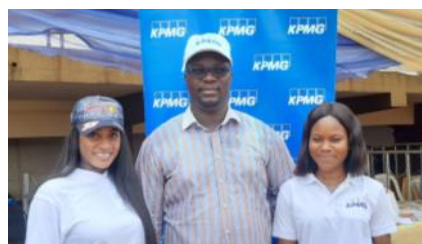
The KPMG team at the Fair