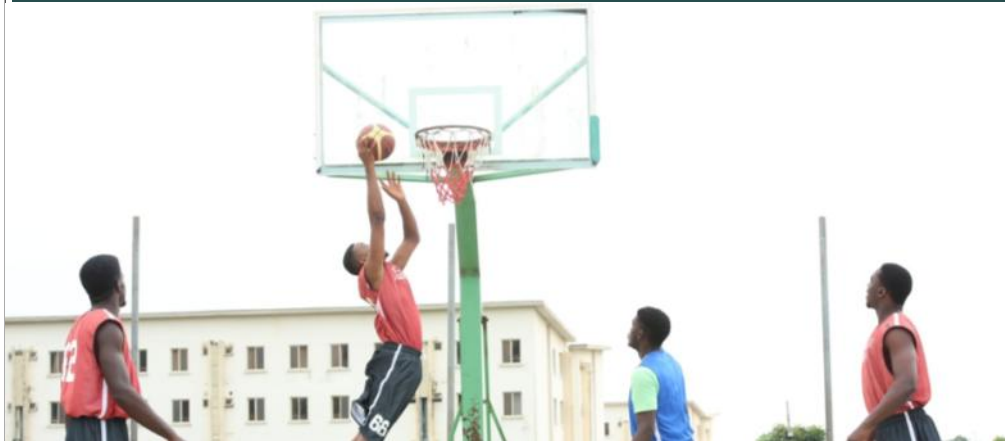
BU Basketball team getting set for the games.

Two years have rolled by and Babcock University (BU Team) is preparing to go and make the university proud once again.