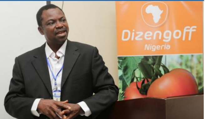
Prof, Stephen Fapohunda: Commends initiative

from government initiative to support agricultural sector to feed the nation.