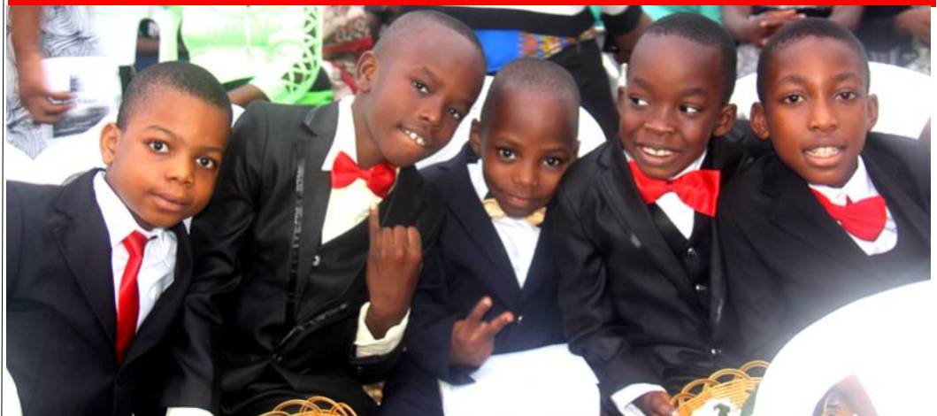
Staying cool: Young, garland-carrying team members for the Uninfluenced group stand out at the Feast of Light while waiting for the programme to begin.