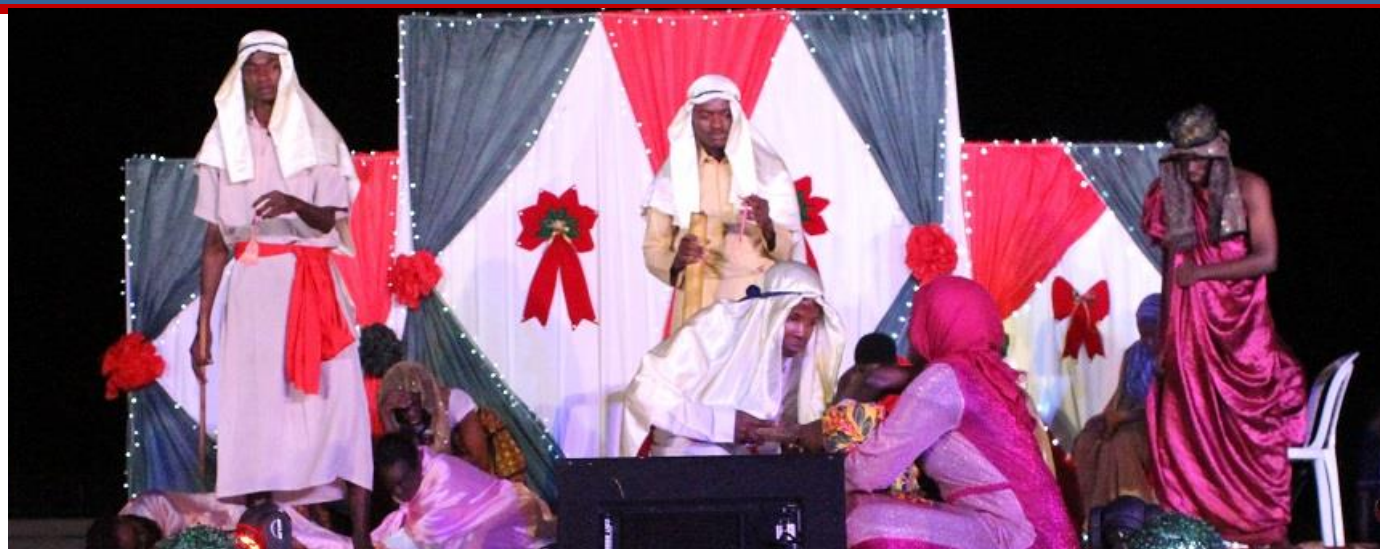
A scene from the adaptation of the Nativity put together by the Classic World Concept group during the Feast of Light. Bottom: Students pose with one of the event's mascots.

The University Sports complex was a kaleidoscope of colours as more than 10,000 persons turned out to celebrate the Feast of Light , a medley of carols, scripture and drama to usher in the holiday season.