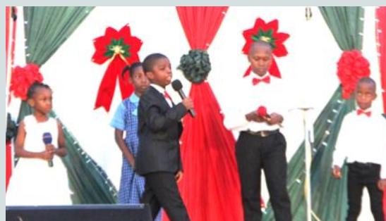
The children, joyful faces and dramatic scenes that marked high moments at the Feast of Light .