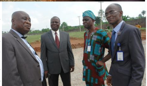
Principal officers putting heads together.

dream come true for sports development in the university with prospects for greater returns on investment.