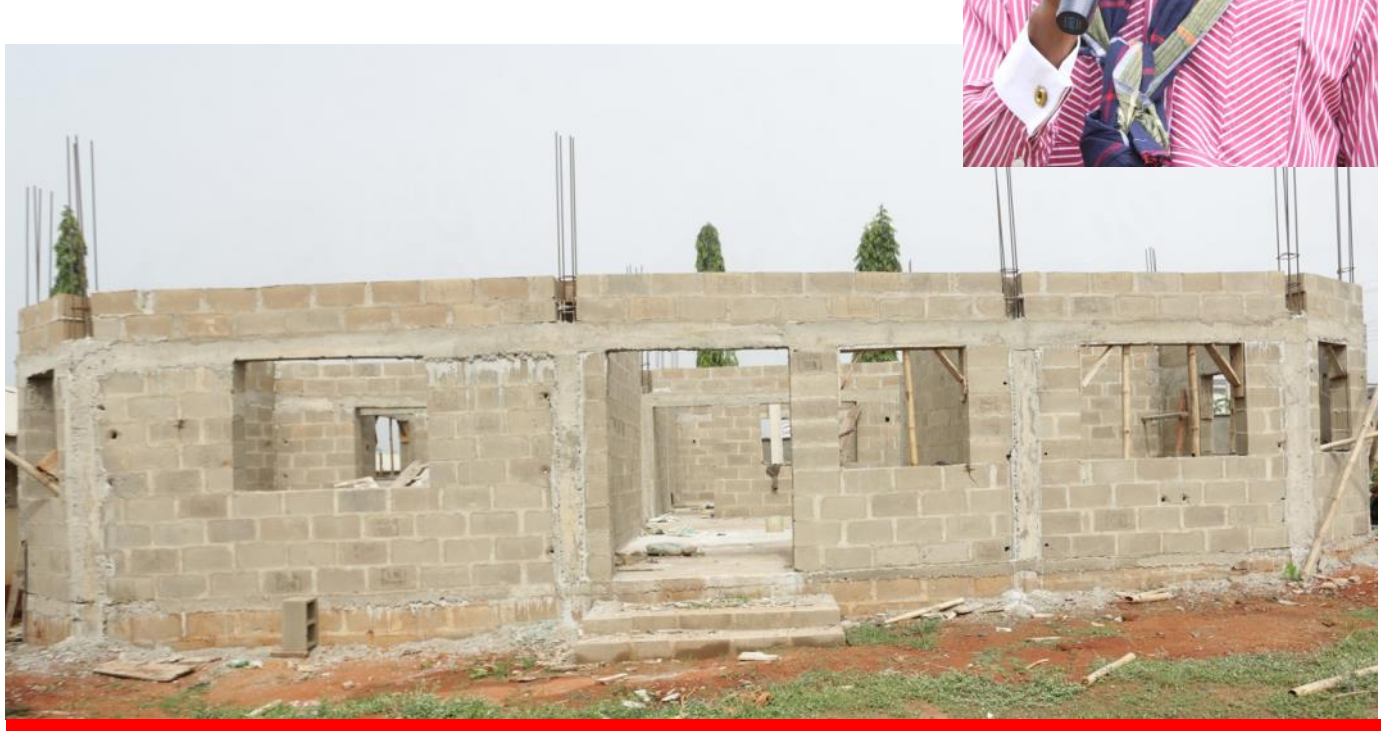
Front view of the on-going BU Staff School classroom project Top right: Elder Israel Aja

"For us, this means only the best is good enough."