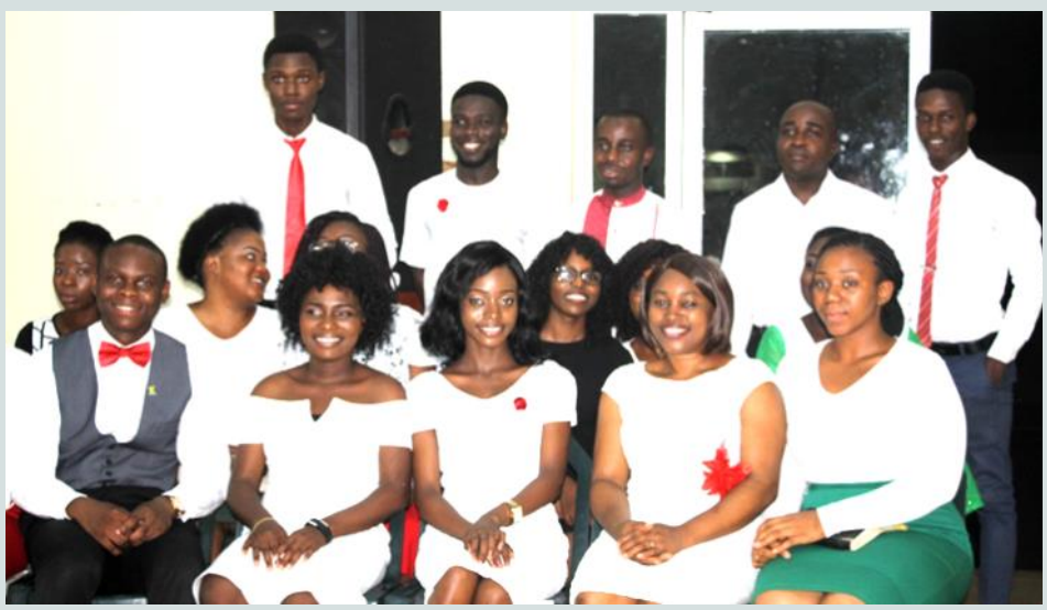
Praising God for a successful end of the semester. The faces and scenes at the Grace Chapel and Chapel of Light.