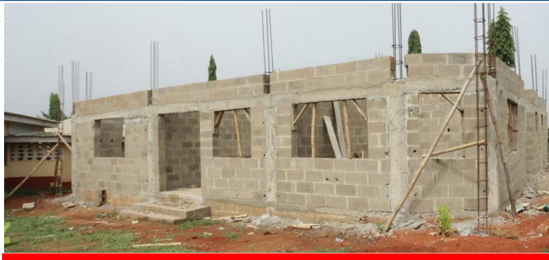
Work in progress: Side façade of the classroom project at the BU Staff School

The Head Teacher, Elder Israel Aja, is optimistic that the school would grow in infrastructure as well as academics.