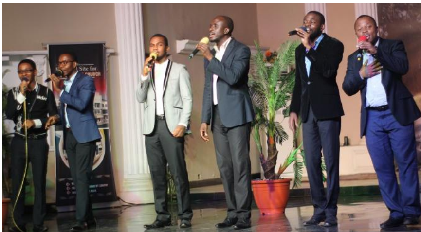
King of Hearts: The Chord singing group perform to raise funds.