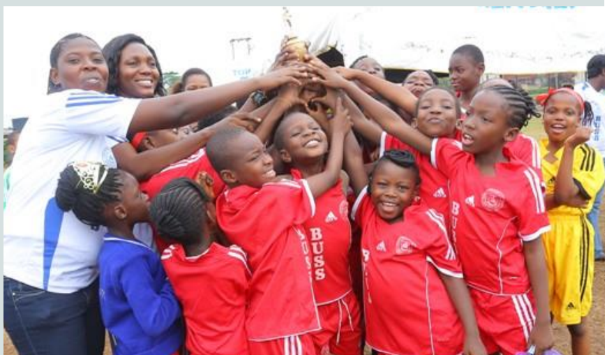
Savouring the taste of Victory: Red House celebrate.

Parents and friends braved the elements to cheer pupils of the BUSS to victory at the 23 rd inter-house sports last week.