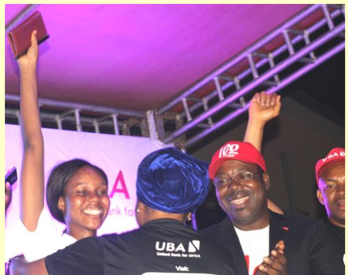
Winner of the I-Phone X at the UBA Leo Virtual Banker event.