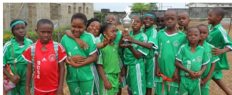
Clockwise: Yellow House celebrates their victory with their trophy Blue House picks trophy for 3 rd place in march past Green House in victory mode after collecting their trophy at the inter-house sports