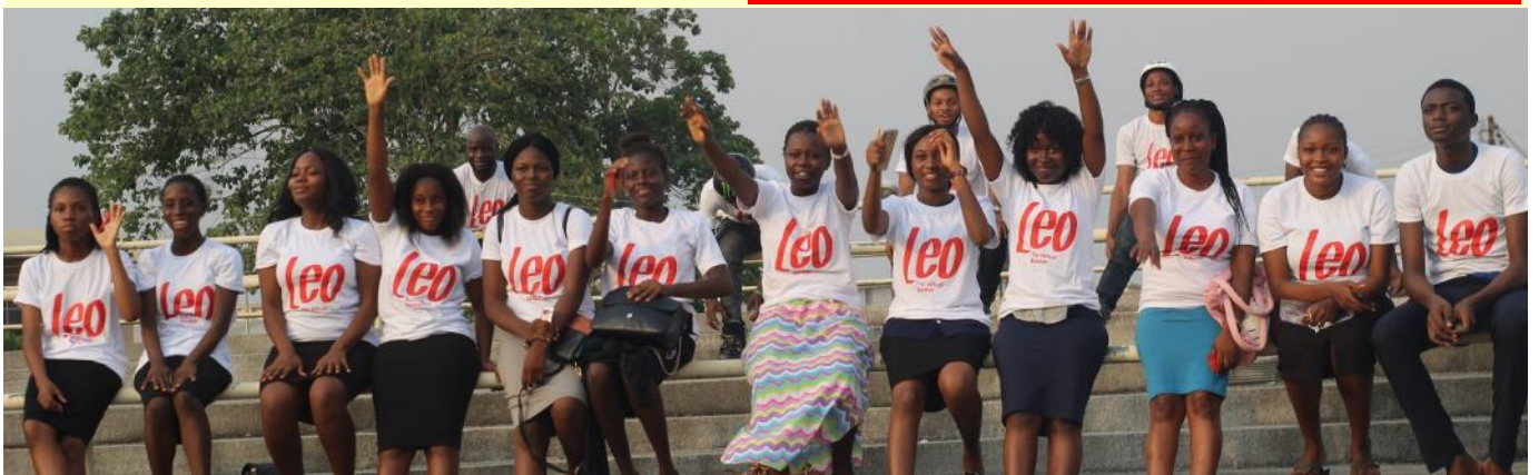
Babcock students identify with the new product as they proudly display their T-shirts at the event.