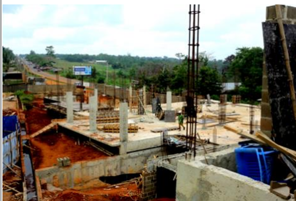
Arial view of the construction work in progress.