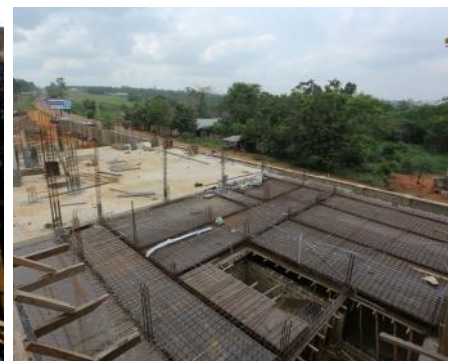
Casting of one of the floors.