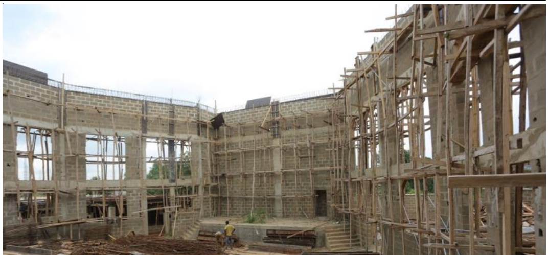
Work in progress: The 600-seater auditorium and office block under construction. Below are other faces of the project.