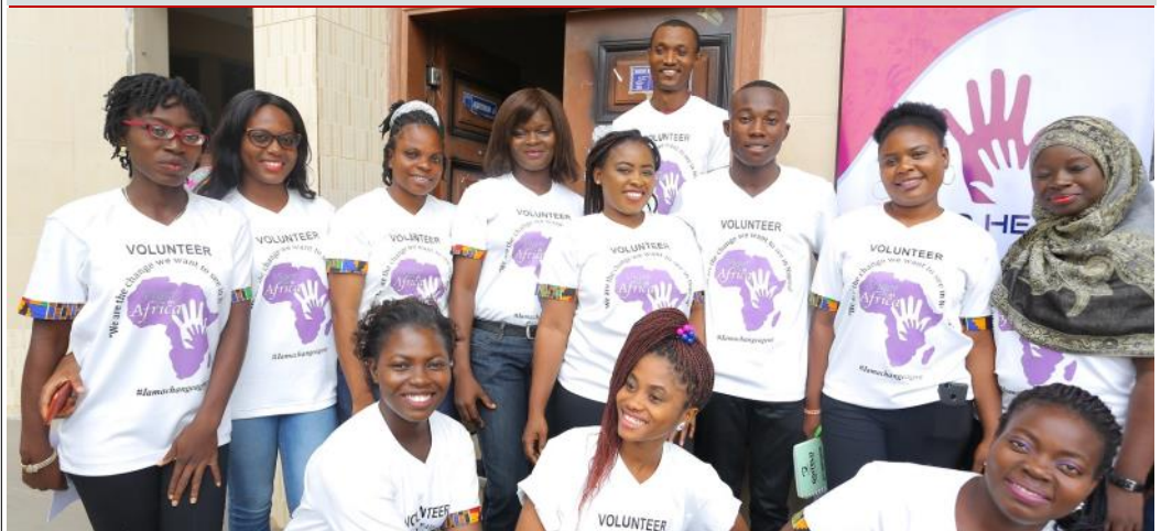
Volunteers for Effective Collaboration: Participating volunteers at the Nursing Seminar for effective collaboration held recently in Babcock.