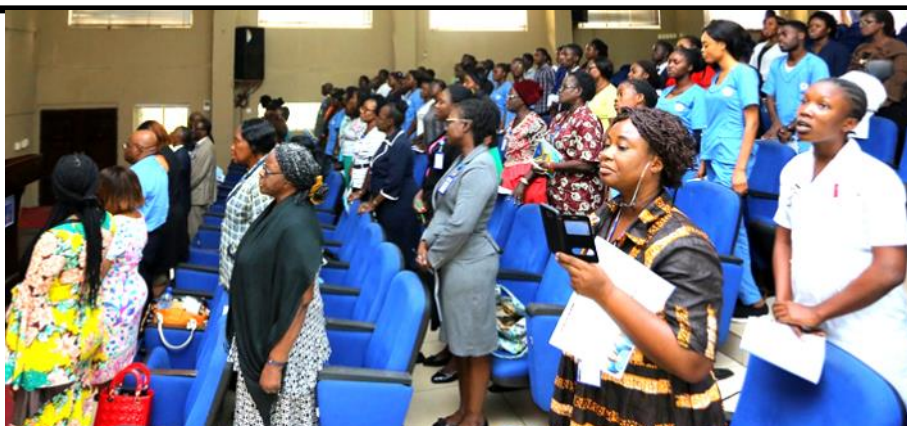
A cross section of participants take the national and Nurses anthem.

“We in the diaspora have a role to play in knowledge sharing with stu-