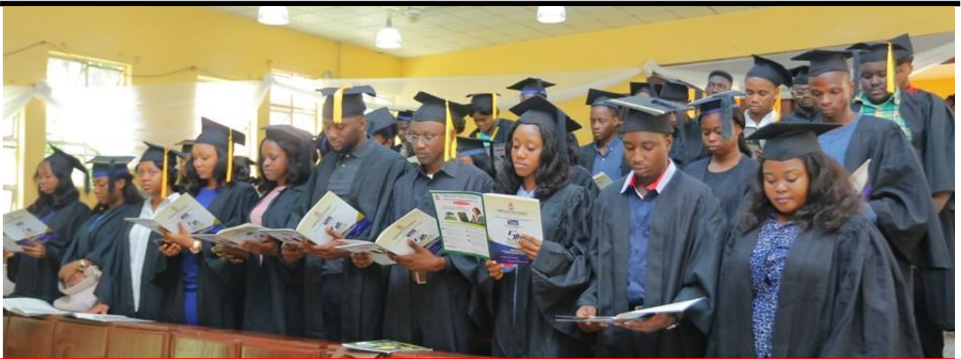
A cross section of the 2017/2018 computer graduates take their oath of allegiance at the induction ceremony