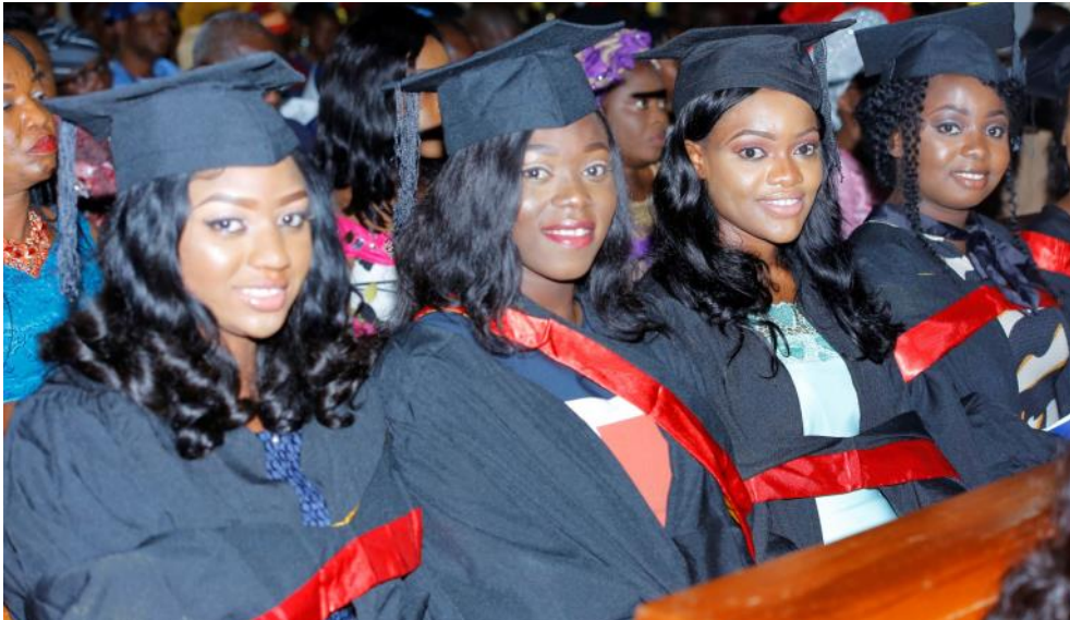
Smile of success: A cross section of the new inductees at the ceremony.