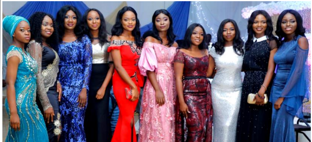
Waiting to soar: Newly qualified medical doctors of the Benjamin Carson Snr. College of Health and Medical Sciences, at a special dinner held in their honour in Babcock.