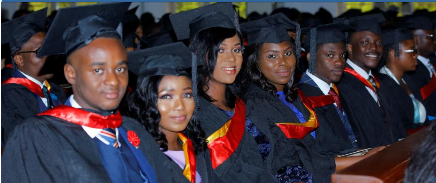
Eyes on the future: A cross section of the newly qualified doctors .

The Medical and Dental Council of Nigeria (MDCN) has formally admitted 48 newly qualified medical doctors of the University's Benjamin Carson Snr College of Health and Medical Sciences in a colourful ceremony held on the main campus.