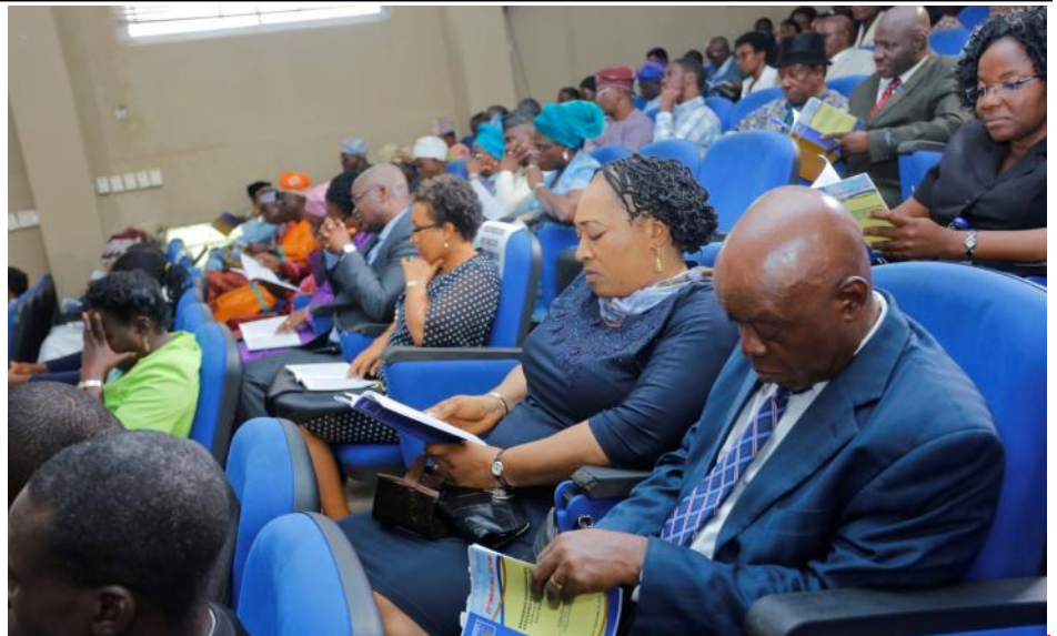
Eyes on the book: A cross section of the audience at the inaugural lecture held at the University's Business School Auditorium.

Another strategy is to develop integrity across board through credible elections and paradigm shift of value system as well as discourage the use of local government caretaker committees;