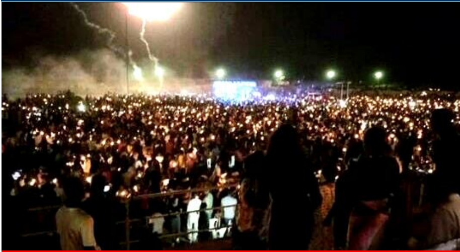
Clockwise: Aerial view of the Sports complex with its fireworks and brightly lit candles, a student holds up her candle, a mascot and duet from the Philadelphia choir add colour to the evening.