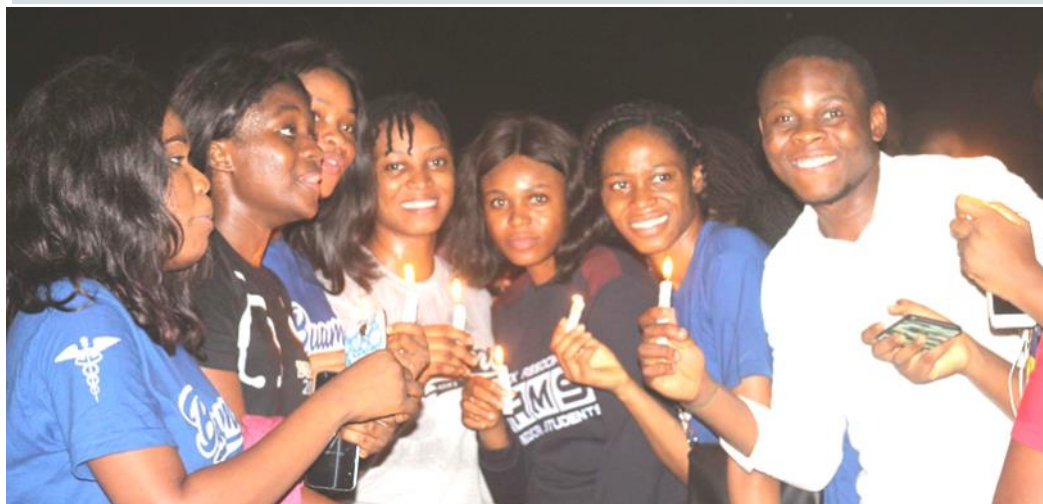
Lighting up the world: Medical students share the joy of the moment with their lighted candles.