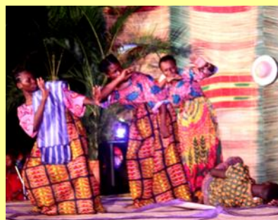
Classic world concept drama presentation and right, BU Staff School pupils.