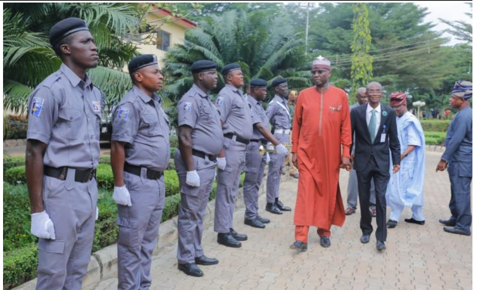
Guard of Honour: The Babcock Security mounts a quarter guard of honour for the distinguished guests.