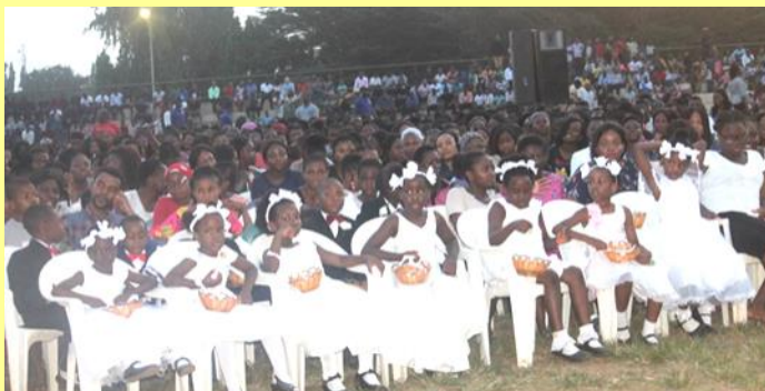
Children ready to decorate the Uninfluenced group sitting behind them to encourage and promote chastity.