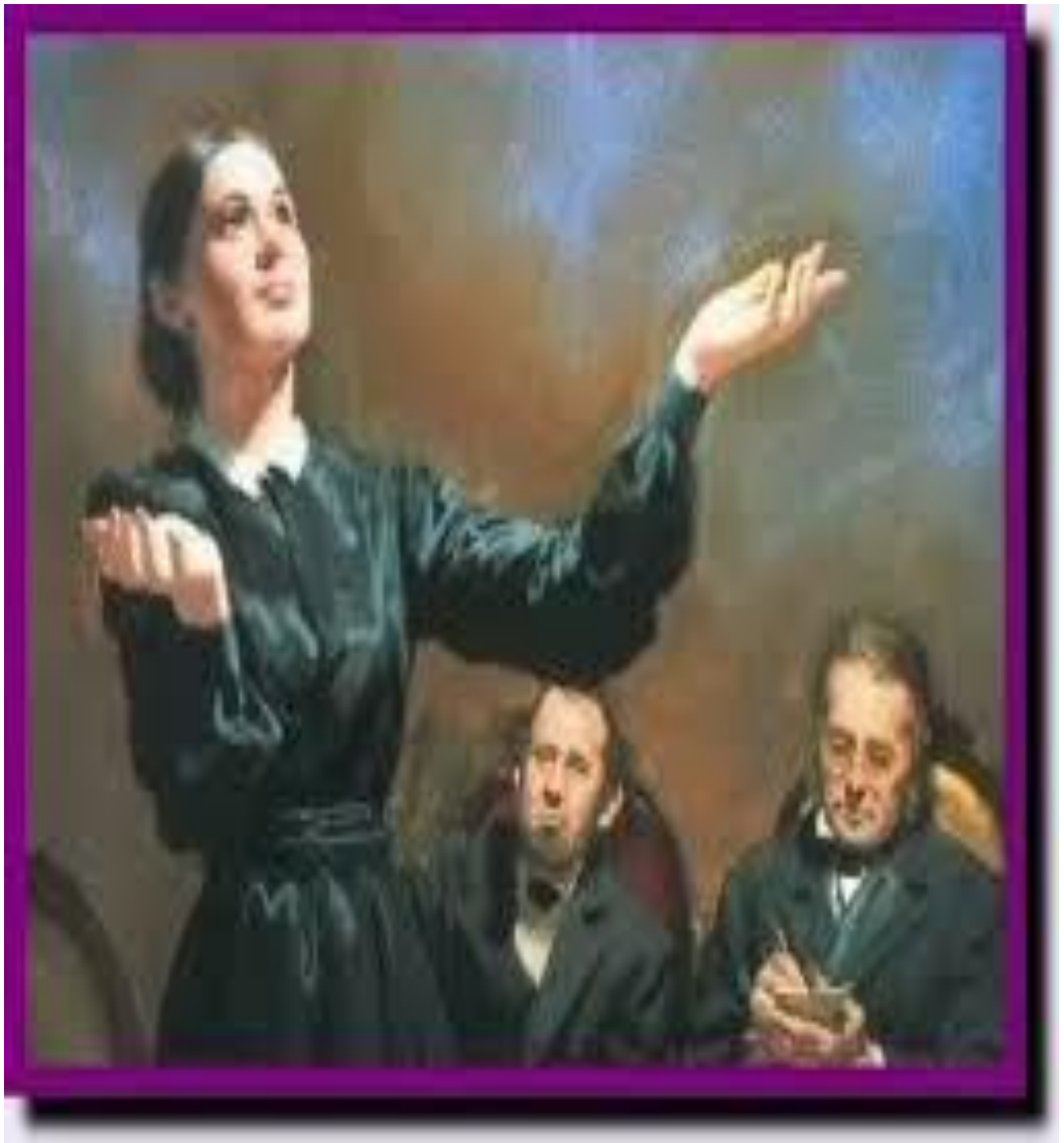
ELLEN WHITE, IN ERRAND FOR GOD