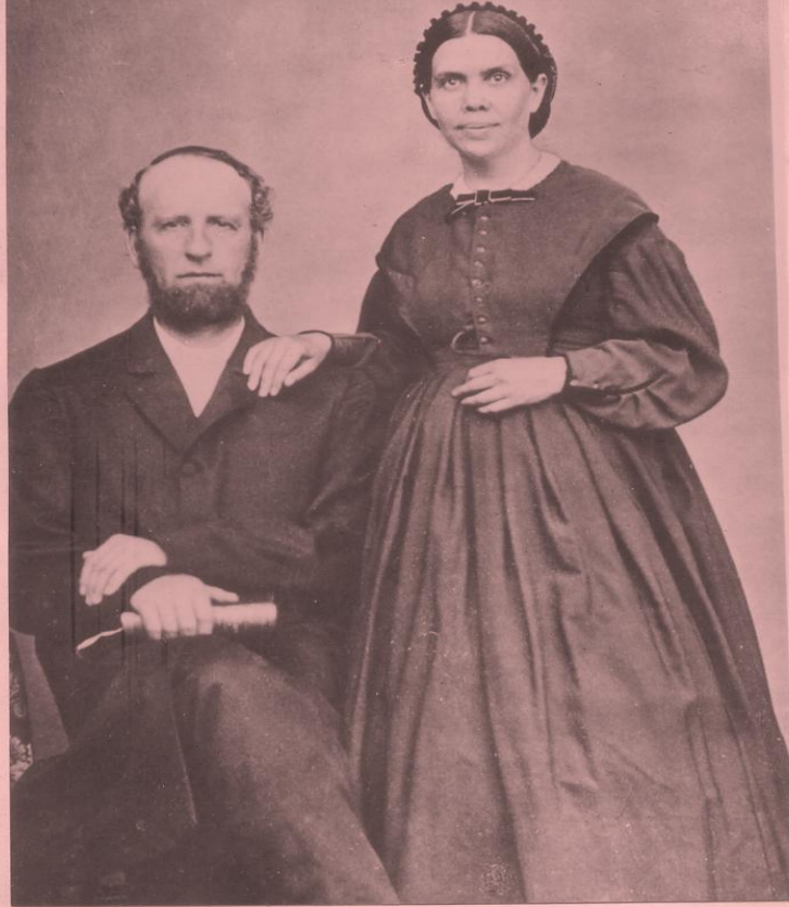
James White and Ellen Harmon were married in Portland, Maine August 30, 1846

ELLEN WHITE, AND HER HUSBAND JAMES WHITE