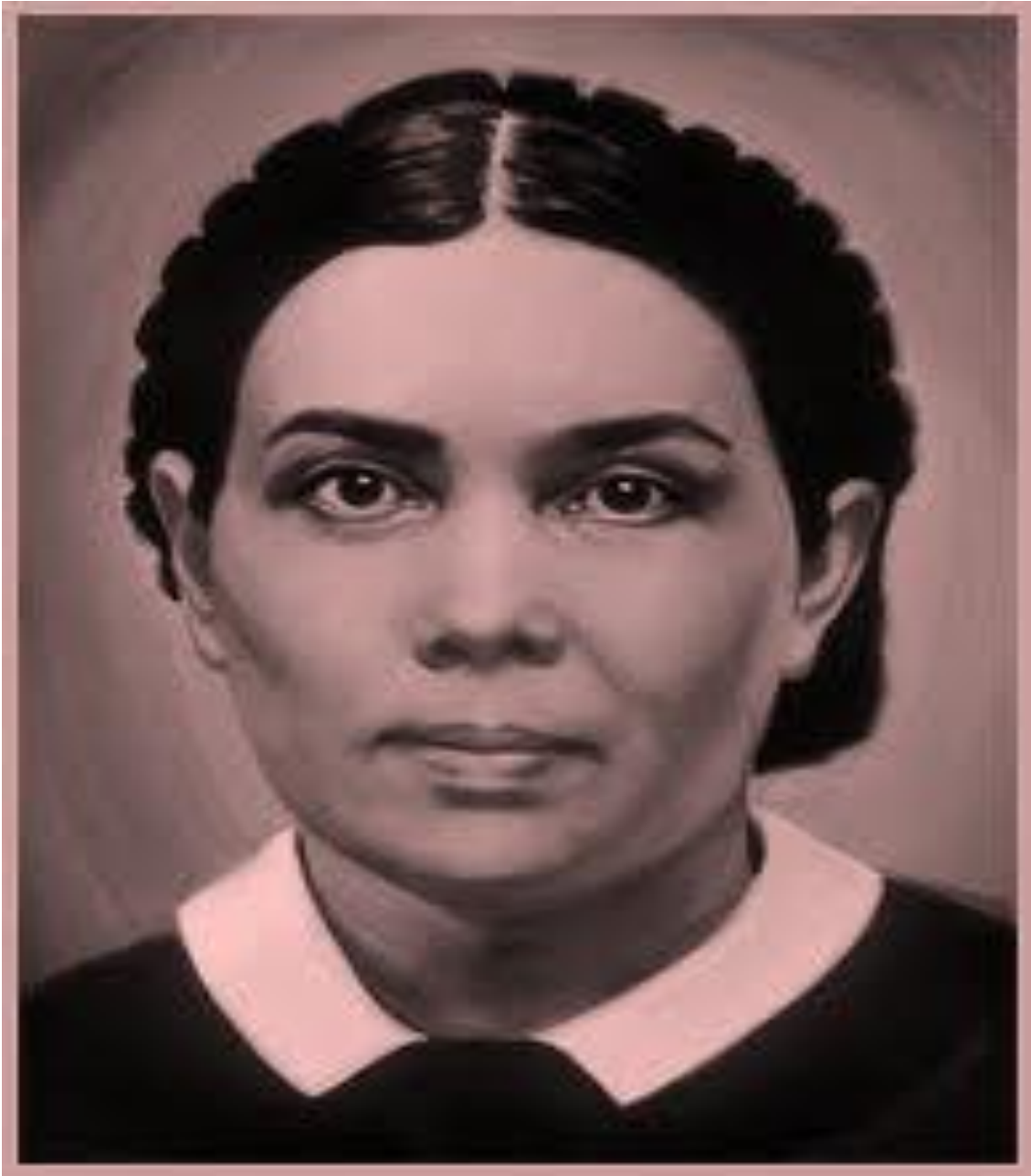
ELLEN WHITE @ 35