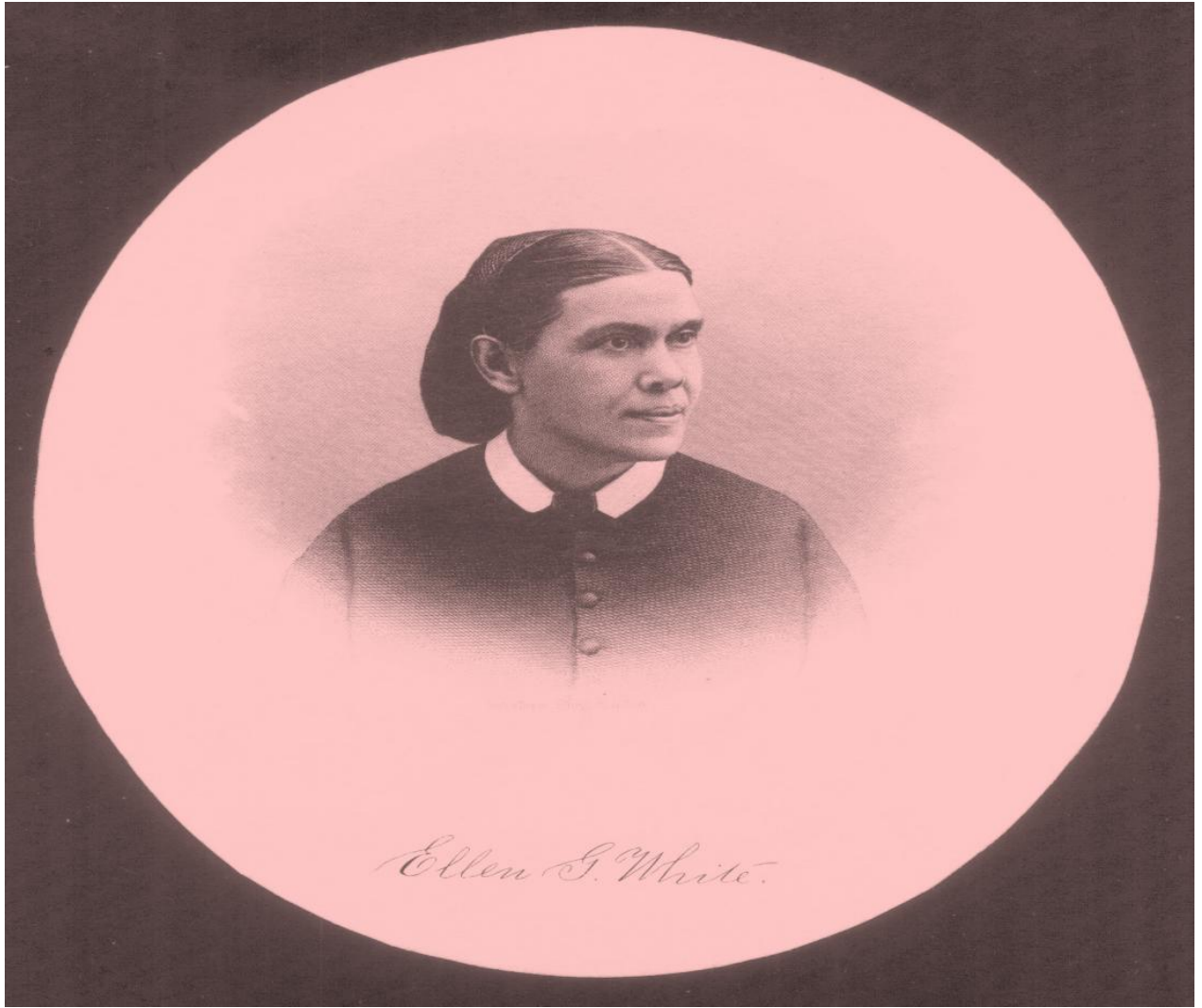
ELLEN WHITE IN A VISION