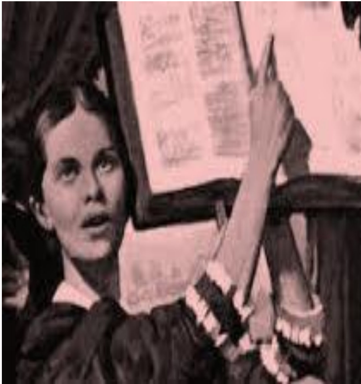
ELLEN WHITE'S VISION OF THE LARGER BIBLE