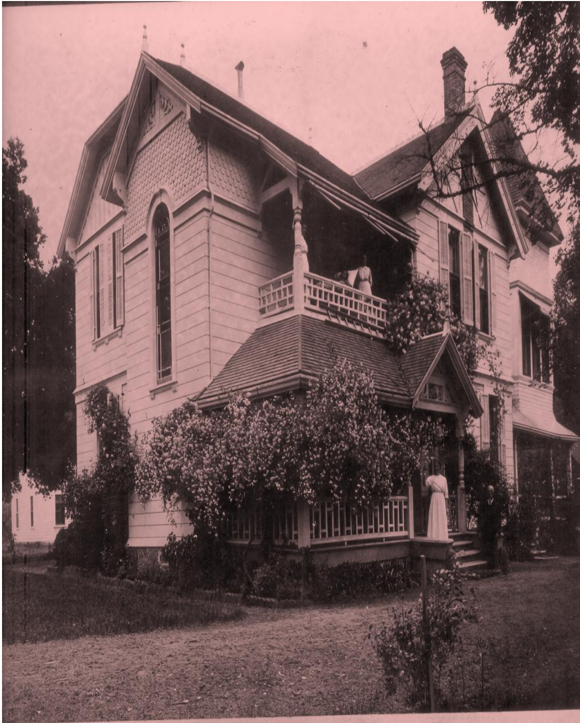
Elmshaven — Mrs. Ellen G. White's Home