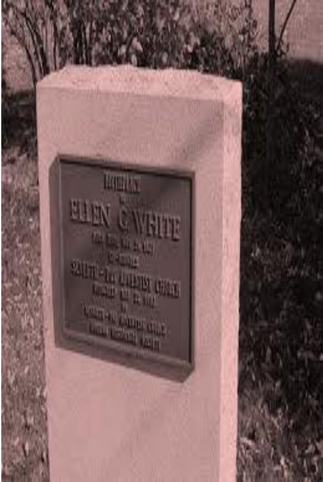
ELLEN WHITE'S GRAVESIDE