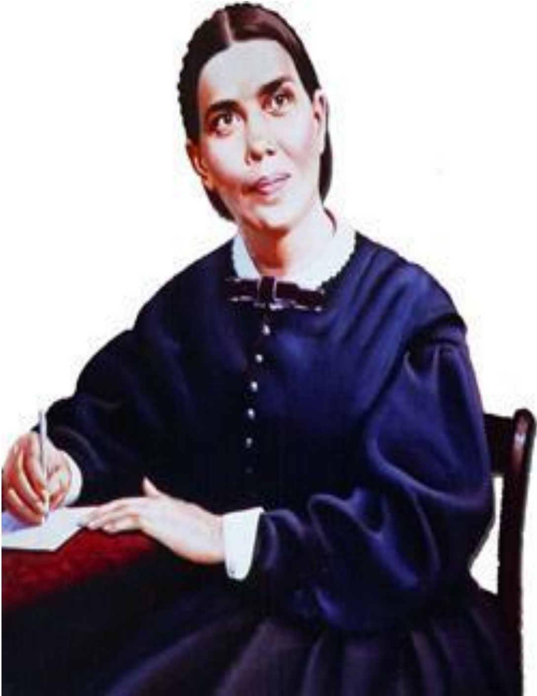
ELLEN WHITE IN A VISION