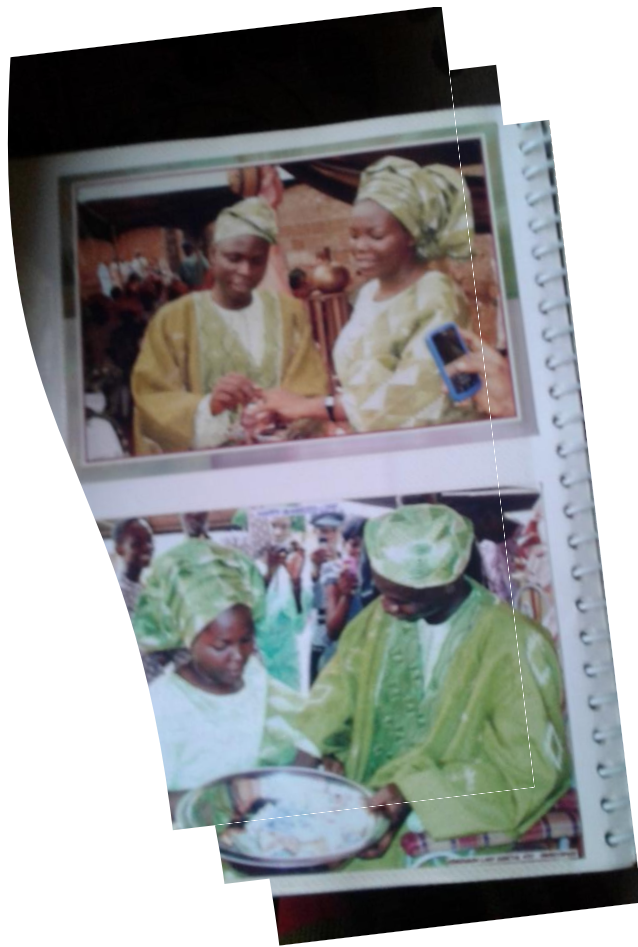
Baba's ground daughter's traditional marriage ceremony