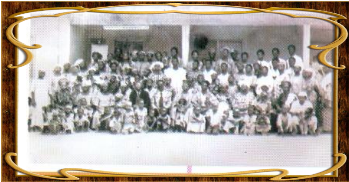
BABA WITH MEMBERS OF OKE-ILA SDA CHURCH