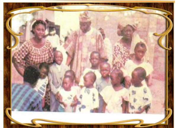
BABA & GREAT GRAND CHILDREN