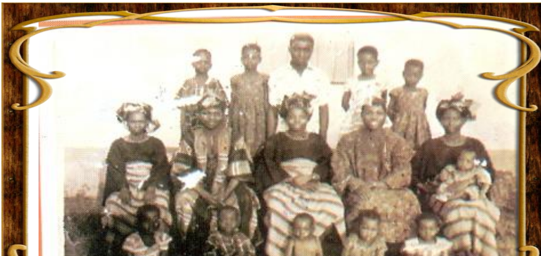
BABA'S FAMILY AND THEIR FAMILY FRIENDS FROM ERUNMU